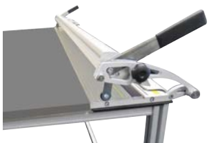
Only uses one worktop to bring the cutter base level to the worktop.