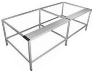
Evolution Bench Aluminum base plate for easy alignment of the mounting brackets.